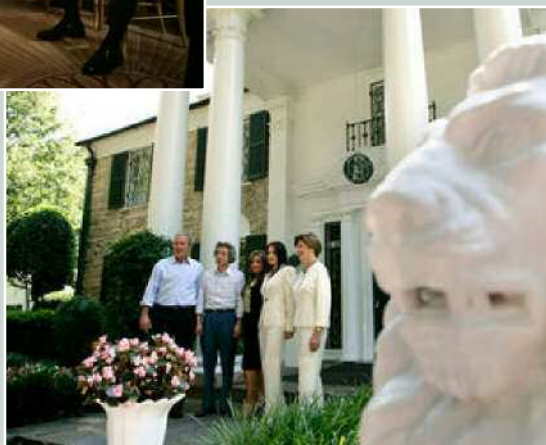
President George W. Bush, Laura Bush and Japanese Prime Minister Junichiro Koizumi are welcomed to Graceland, the home of Elvis Presley, by his former wife Priscilla Presley and their daughter Lisa-Marie Presley, Friday, June 30, 2006 in Memphis.

Speaking about the trip to Graceland, President Bush commented the visit is an indication of how well-known Elvis was around the world and a way of reminding us about the close friendship between our peoples.