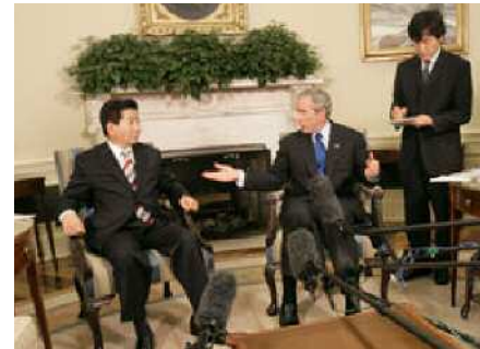
Presidents Roh and Bush engage in a meaningful dialogue in the Oval Office on September 14, 2006.

On September 14, 2006, President Bush and President Roh Moo-Hyun of South Korea met in the Oval Office for a brief meeting. During this time, they reaffirmed their commitment to the six-party talks in order to peacefully deal with the North Korean issue and discussed the importance of a free trade agreement to benefit our respective peoples and further strengthen our economic relations. The meeting consisted of remarks by President Bush, followed by remarks by President Roh. The meeting was followed by a private luncheon.