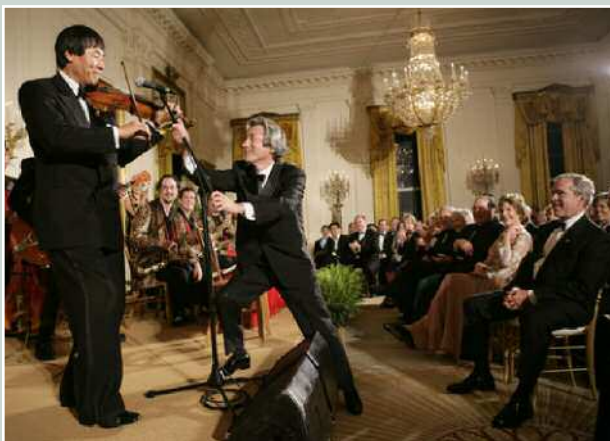
President George W. Bush watches as Japanese Prime Minister Junichiro Koizumi adjusts the microphone for country music entertainer Shoji Tabuchi Thursday evening, June 29, 2006 in the East Room of the White House, during the entertainment following the official dinner in honor of Koizumi's visit to the United States.